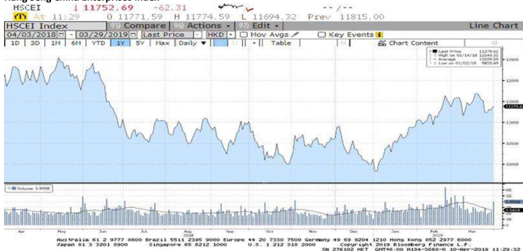
FIGURE 2 Hang Seng China Enterprises Index