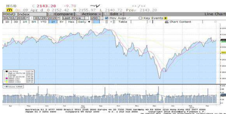
Chart of the Month: MSCI World Index