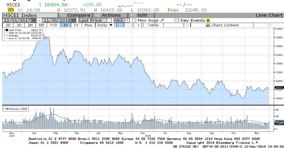
FIGURE 2 Hang Seng China Enterprises Index