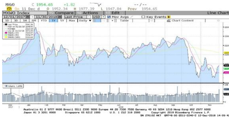
Chart of the Month: MSCI World Index