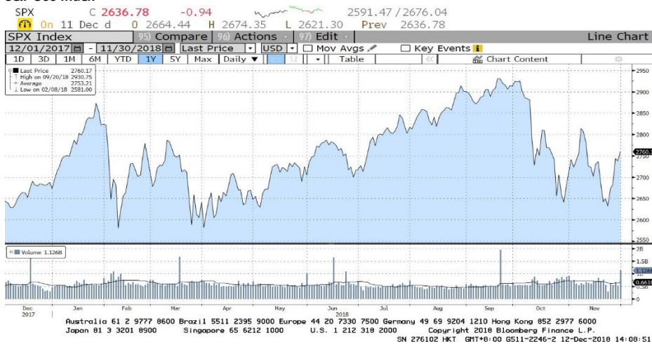
FIGURE 3 S&P 500 Index