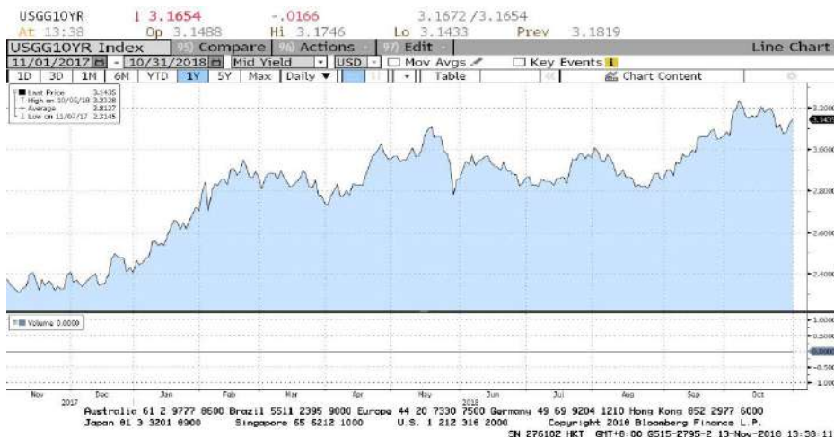
FIGURE 1 US 10 years treasury yield

US inflation is still in the doldrums, but 10-year bond yields rebounded.