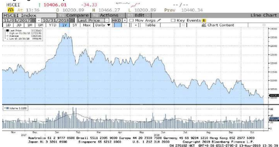
FIGURE 2 Hang Seng China Enterprises Index