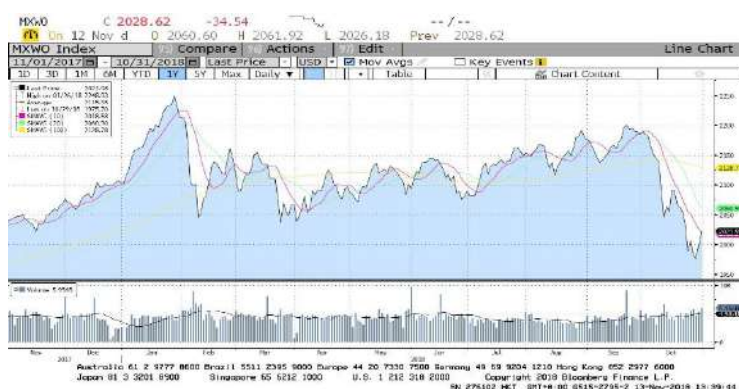
Chart of the Month: MSCI World Index